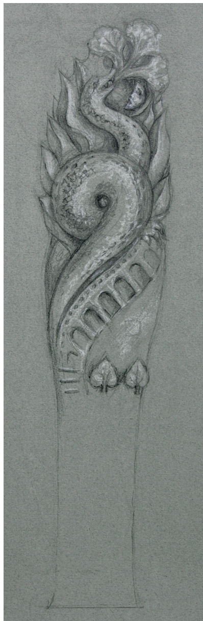
Waymarker 4 Balcombe

17. Walk on until you reach Newlands, the road curves round to the right and when you see a red postbox ahead you need to turn left, cross the road and follow the path toward Balcombe Station. Cross over London Road at the island and go in the pedestrian entrance (WAYMARKER 4), over a bridge and down the steps to the platform to return to the car park.