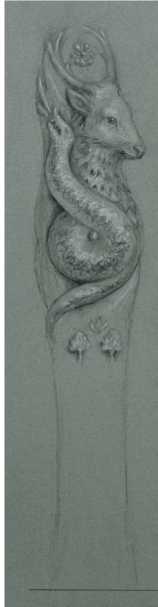
Waymarker 2 Ansty